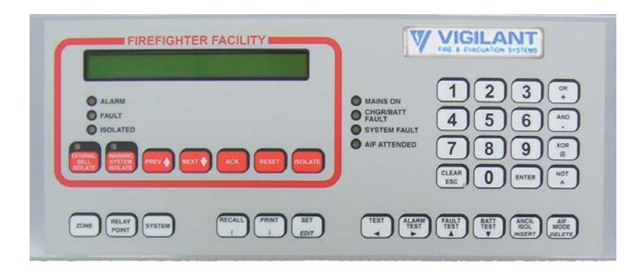
Control Panel Layout

Site-specific configuration parameters are stored in non-volatile flash memory, which remains protected even if the system's power supply is removed. Programmed information is access code protected, with ten programmable codes available to allow access by different users to be individually logged.