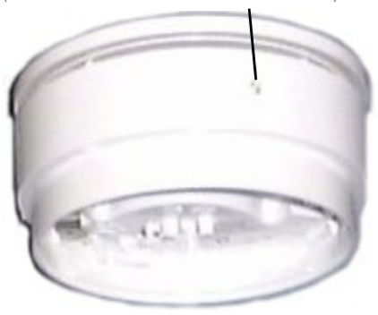
Fig.5. Volume Adjuster (Anti-clockwise to decrease volume)