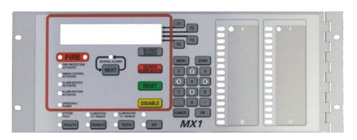
ME0464, ME0465 Front View

Contains a 4U door assembled complete with the MX1 membrane keypad, LCD/keyboard PCB, LCD module, FRC cable clamps, and these Installation Instructions (LT0466).