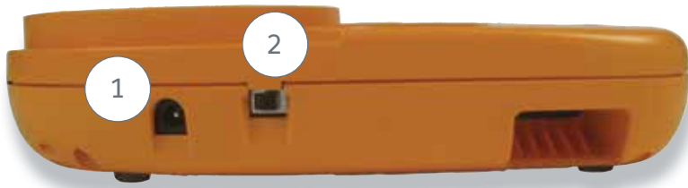
Left Side View 1 - DC IN 12V External Connector 2 - Power On/Off Switch