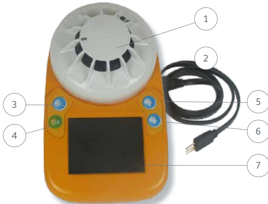
Top View 1 - Detector on Tool Base Twist detector clockwise to engage and lock in position 2 - Ancillary Lead Used for programming MX devices 3 - Escape Button 4 - OK Button 5 - Up Arrow Button 6 - Down Arrow Button 7 - LCD Touch Screen