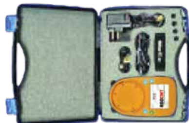
850EMTK 850EMT Service Tool Kit