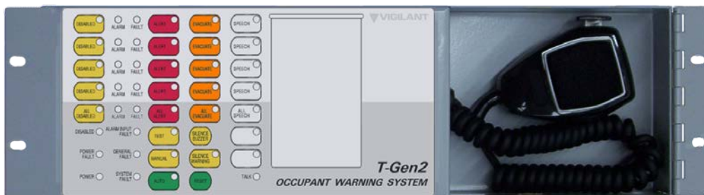
FP1124 / FP1125 4-Zone User Interface

Australia Level 3, 95 Coventry Street Southbank VIC 3006 Tel: 1300 725 688 Tel: +61 3 9313 9700 Email: fdp.customerservice.anz@jci.com