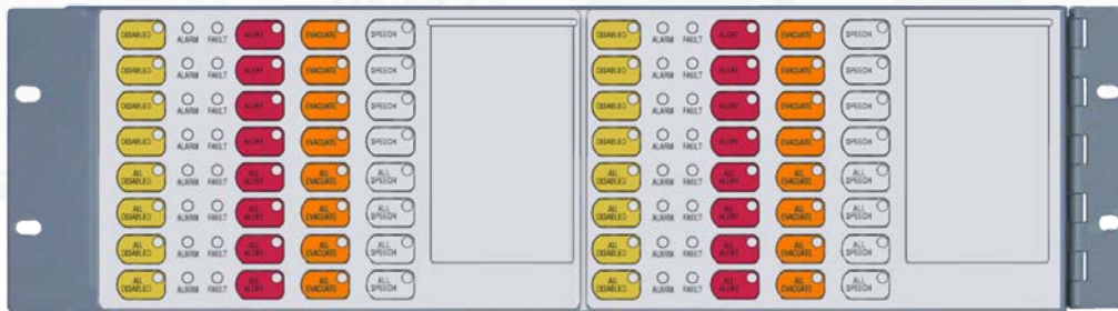
FP1126 / FP1127 16-Zone Extender (8-zones fitted)