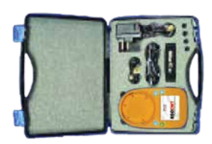
850EMTK 850EMT Service Tool Kit

850EMT Service Tool Kit Stylus Ancillary Lead Carry Case & Accessories Anc. Lead Spare Pins (Pk 10)